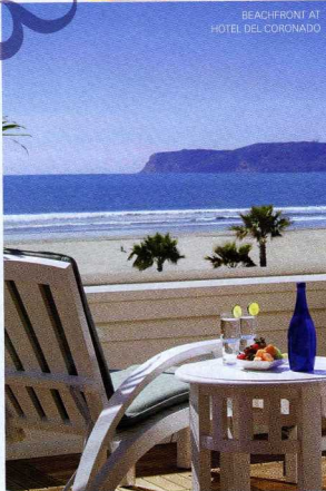
BEACHFRONT AT HOTEL DEL CORONADO