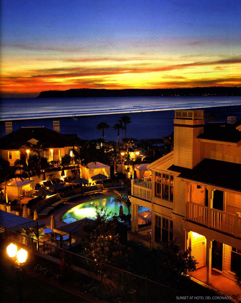
SUNSET AT HOTEL DEL CORONADO