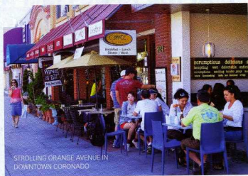
STROLLING ORANGE AVENUE IN DOWNTOWN CORONADO

WHERE TO DINE: The best dining we had on our most recent visit was Mistral, located at the Loews Resort. Their bistro-inspired menu and astonishing views created an unforgettable five-star culinary piece d' resistance, and a new chef promises even better gastronomic adventures in the future. Restaurants at 'The Del' include the newer 1500 Ocean and the Sheerwater and both were exceptional, but for special occasion dining, 1500 Ocean would be the clear choice of the two. Sunday brunch in 'The Del's' majestic Crown Room is considered a tradition by many San Diegans.