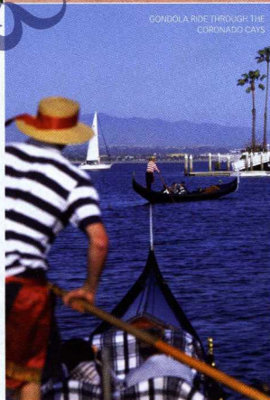
GONDOLA RIDE THROUGH THE CORONADO CAYS