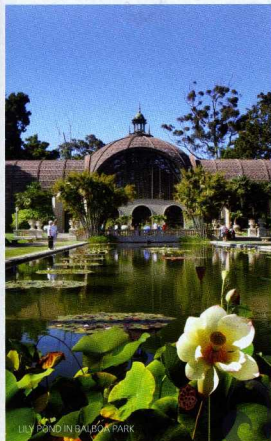
LILY POND IN BALBOA PARK