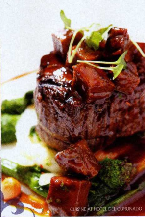
CUISINE AT HOTEL DEL CORONADO