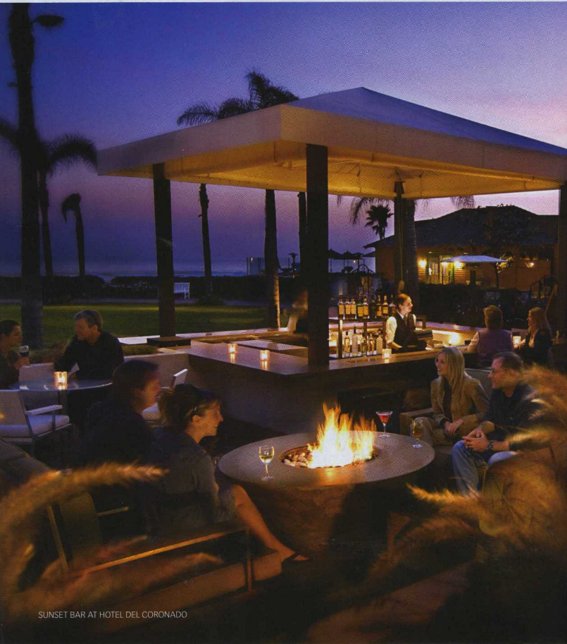
SUNSET BAR AT HOTEL DEL CORONADO