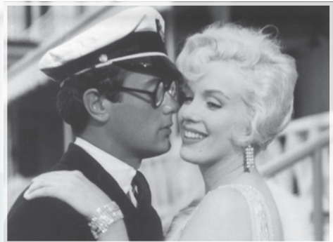
Marilyn Monroe & Tony Curtis during the filming of "Some Like It Hot"

Shampoo and style, makeup application, signature manicure, signature pedicure, glass of champagne